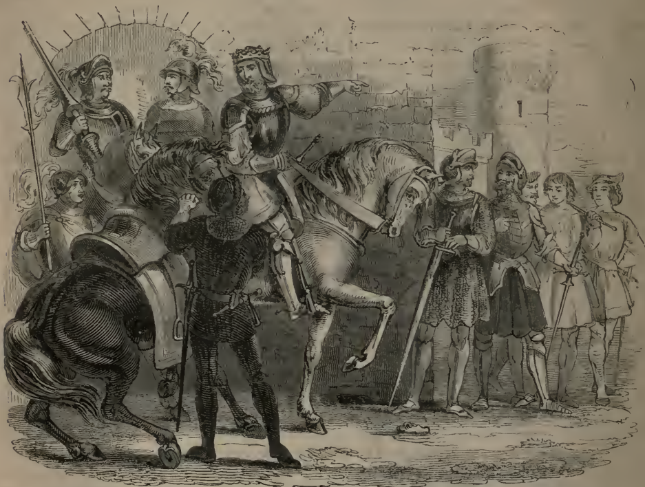
KING ROBERT OF SCOTLAND and his Nine Sons who loved arms. Designed from Contemporary Illuminations.

At last, king Robert of Scotland arrived, with red bleared eyes, of the colour of sandalwood, which clearly showed he was no valiant man, but one who would rather remain at home than march to the field: he had, however, nine sons who loved arms. On the king's arrival at Edinburgh, the barons of France waited on him to pay him their respects, as they well knew how to do: the earls of Douglas, Moray, Mar, Sutherland, and several more,